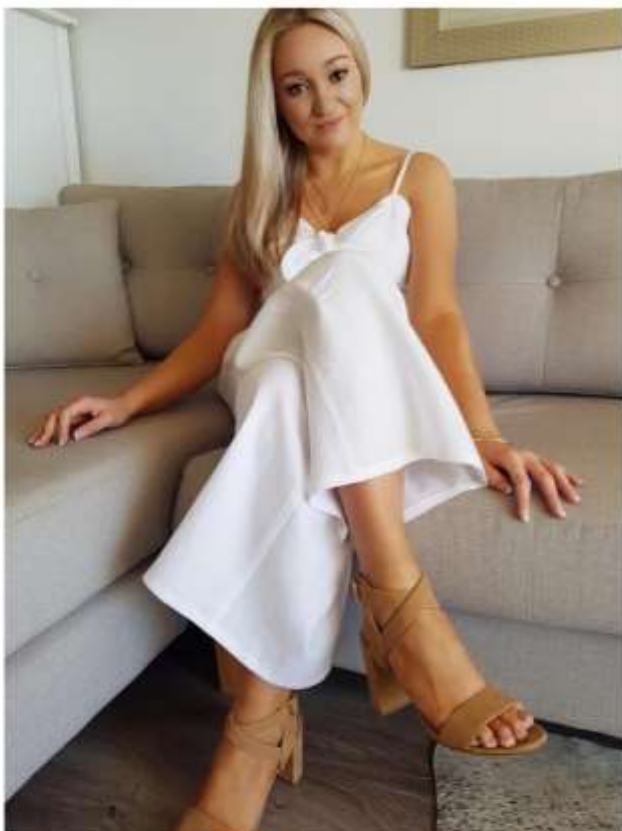
Beautiful Linen Clothing